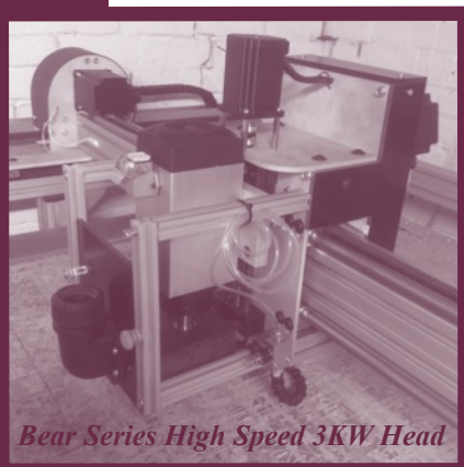
Bear Series High Speed 3KW Head